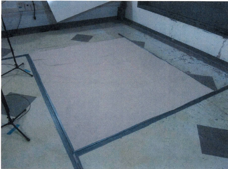
Installed Specimen Dayton Straw