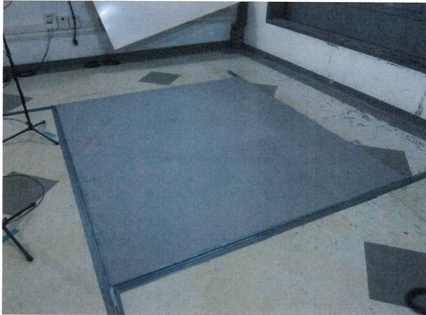
Installed Specimen Traction Chrome